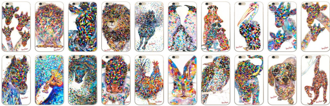
Some of the iPhone cases

Tracey has always been good at art and she has also learnt about business and marketing. She figured she could create a product and then market it to the world. This is how it all started. Then she thought she needed to create something unique with less competition. That is how the iPhone cases and the cushion covers came to fruition.